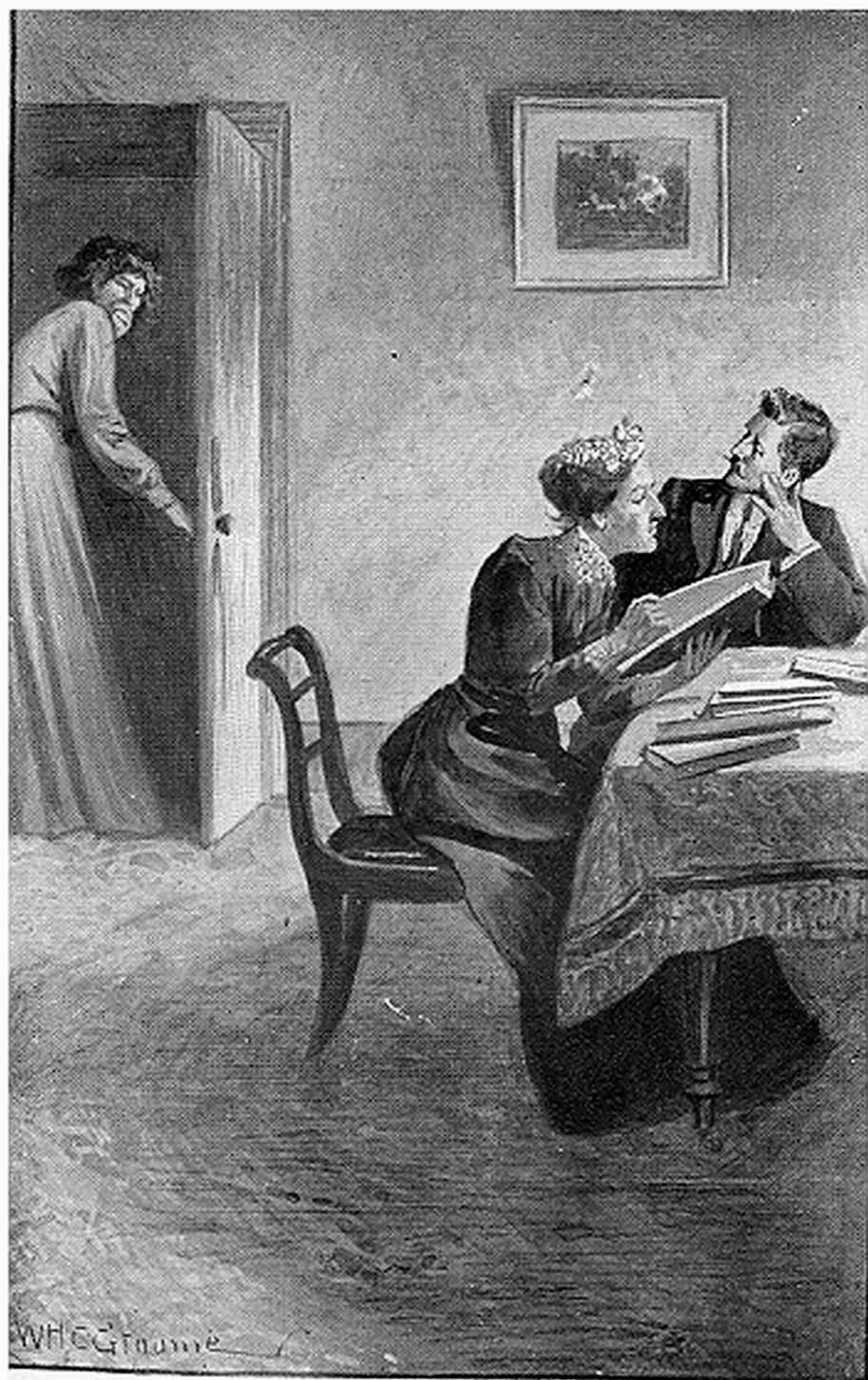
SHE DOUBLED UP WITH SILENT LAUGHTER.